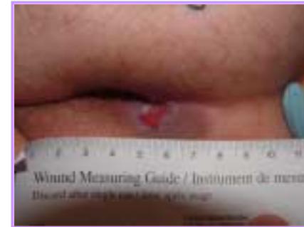
Week 2 EpiFLO; 1.25 x 0.75 cm