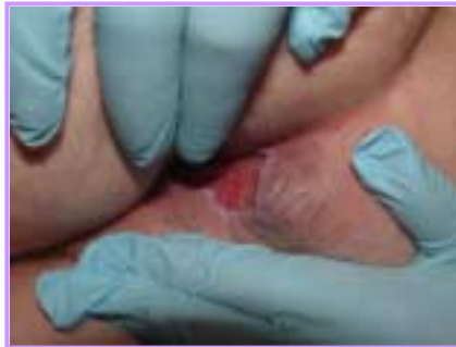
Week 1 EpiFLO; 1.5 x 2 cm; no undermining