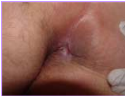
Week 3 EpiFLO; 0.9 x 0.5 cm