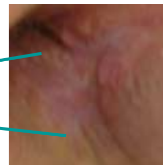
Excellent wound healing cosmesis / quality of healing